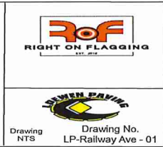
Figure # 7.8 in the TCMWR 2015 Edition Single Lane Alternating This Traffic Control Plan is designed to accommodate patch work on Railway Ave. There is one patch at this location Work to commence Tuesday, Aug. 14th, 2018 and is expected to be completed in one day, however permit will be requested for a week Work hours shall be from 7:00 am - 5:00 pm All signs and traffic devices shall be placed in compliance with WCB and the TCMWR